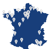
FRANCE 90 assets