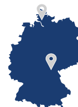
GERMANY 2 assets