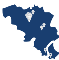
BENELUX 29 assets