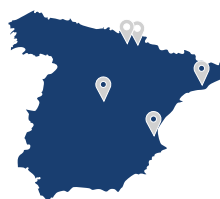
SPAIN 11 assets